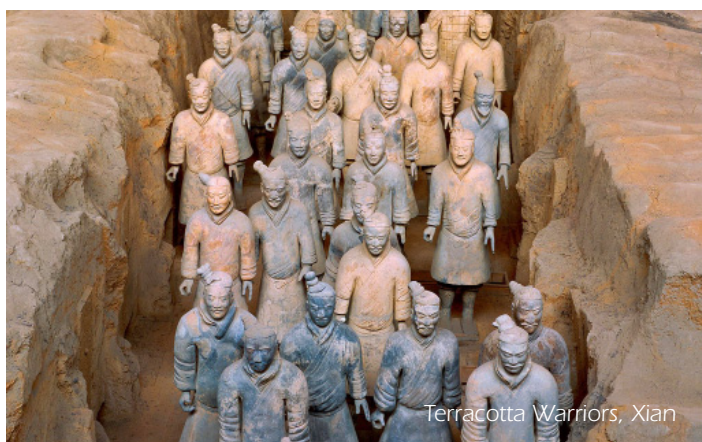
Terracotta Warriors, Xian