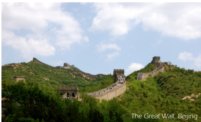
The Great Wall, Beijing