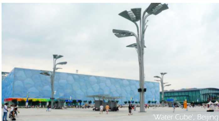
'Water Cube', Beijing

Prices: $2500/adult; $2250/child Land Only: $2380 Single Room Supplement: A$695 Air Ticket Extension: $150 (35 days)