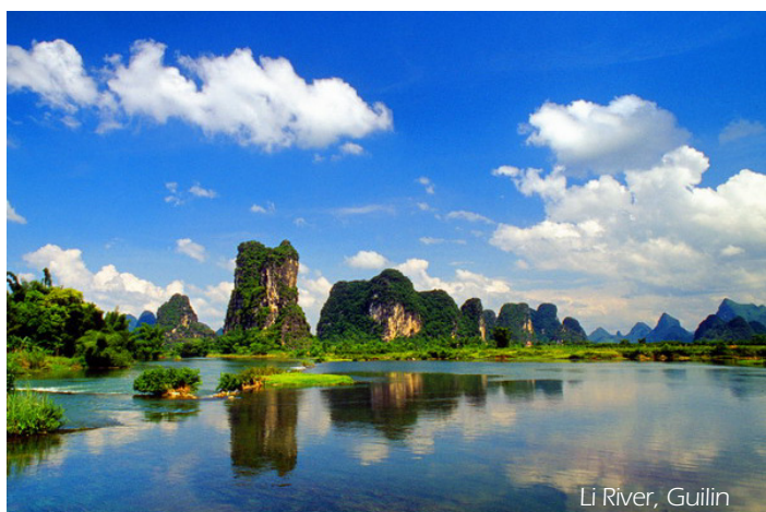
Li River, Guilin